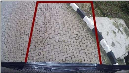
Figure 3: Sign post viewed in the video recording while the bus exiting a side bus stop.

From the observations made through the video recording, it was found the video recording was able to represent the excessive 3 m of long bus. It was evidenced that the potential infrastructures that could cause damages to the infrastructure and bus whenever the bus maneuver at intersections, roundabouts or bus stops were recorded. Road furniture such as sign post and road curb were viewed in the video recording (see Figure 3). Besides, encroachment of the bus rear into the adjacent lane was observed during maneuver and it may hit other vehicles (see Figure 4).