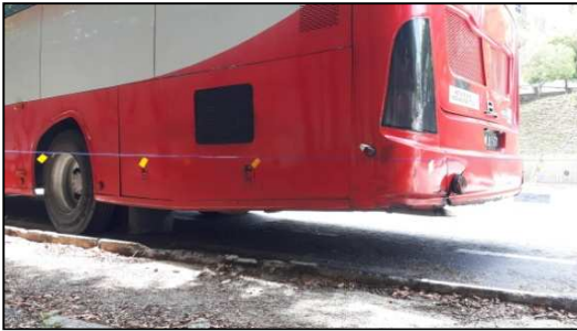
Figure 5: Damages mark on the left rear side of a 12-metre bus.

bus body caused by rear swing out of a normal 12-metre bus. Therefore, allowing a single rigid, long buses of 15-metre to operate in Malaysia may require the drivers to undergo a special training.