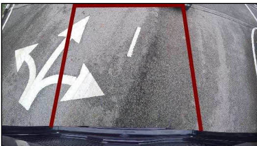
Figure 4: The bus excessive imaginary line at the rear encroached into the adjacent lane during left turn manoeuvre at intersection.

Based on study by Sleath et al. (2006), the difference of rear swing out performance of the actual and design bus is 28%. As the difference is quite small, the predicted impact from the observation may be otherwise (safe) for long bus. The results will be slightly different from the actual 15-m bus where the longer wheelbase and shorter rear overhang would show better rear swing out performance 4 . Whilst the analysis was qualitative, the method will not be able to confirm the predicted impact of long bus rear swing out performance. Nevertheless, near miss impact shall suggest better on-road long bus rear swing out performance.