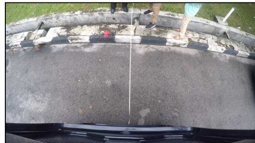
Figure 2: The view angle of the action camera.

The action camera was mounted on a standard mounting accessory pointing rearward at the rear and the mounting was attached to the bus body using a 3M double sided tapes. The view angle was 120 degrees and set to represent the excessive 3 m of long bus (overall length of 15 m) from the rear bumper (see Figure 2). Any infrastructure viewed in the video recording will be identified as the possible impact.