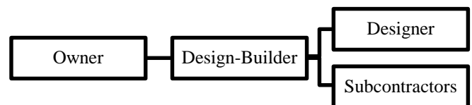
Figure 3. Design-Build [4]

In DB method, a single entity signed a single contract with the owner for the performance of design and construction services [6]. The entity could be integrated design-build firm, contractor led, designer led, joint venture or developer led [3]. This method encouraged team collaboration and enable early involvement of contractor to give input and took part in the budgeting, programming, financing, assessed the design for constructability and cost of construction [6].