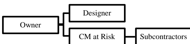
Figure 2. CM at Risk [4]

The commitment from CM at Risk was required in this project delivery method in order to deliver the project within a specified schedule and price, either a fixed lump sum or guaranteed maximum price (GMP) [3]. There were three linear phases in the project delivery process; design, bid and build however, it was faster compared to the traditional method [3]. The CM at Risk usually was assigned to the contractor [6] and had two different roles; (1) as a consultant to the owner regarding construction and cost during the pre-construction phase and (2) as a general contractor in the construction phase [4]. This method allowed for team integration as the CM at Risk integrated with the designer at the early stage of design phase even though the owner had separated contracts with CM at Risk and designer [4]. The contractor's perspective and input would benefit the owner in developing the correct estimation of construction cost, scheduling, assessing the designer's plan for construction, procuring and negotiating tenders and coordinating numerous aspects of the work [6].