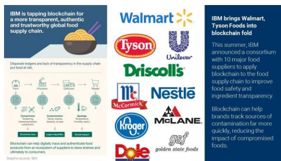
Figure 2: Sustainable Block-chain