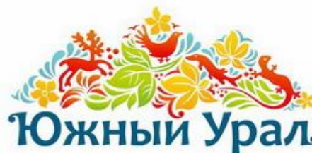
Figure2. Brand of South Ural.

Against the background of contours of the Ural Mountains and also flowers and fallen leaves various animals inhabiting this region are represented: deer, birds, lizards. This brand was developed in 2012 and is used in the sphere of tourism for the purpose of more effective advance of this region now.