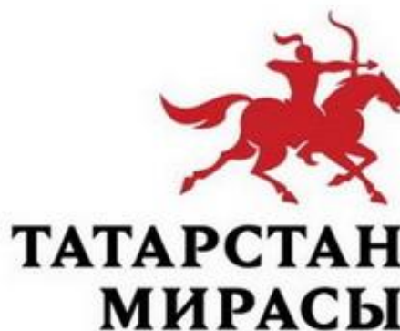
Figure7. Brand of the Republic of Tatarstan.

On a brand of the Republic of Tatarstan the mythical soldier Batyr sitting on a horse and shooting a bow is represented. 10 qualities which it is the fullest, according to his creators are the basis for a brand, form the Tatarstan type of the personality. Are among these qualities: