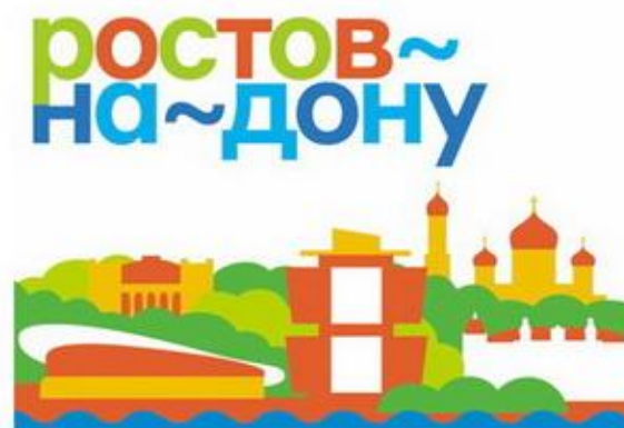
Figure10. A brand of the city of Rostov – on – Don.

other constructions of one of the largest cities of the South of Russia.