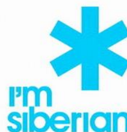
Figure3. Brand of Siberia.

The idea about huge spaces and a frigid climate is the cornerstone of a brand of Siberia. The drawn snowflake symbolizes huge territories, the covered snow, permafrost and hard frosts. This symbolics can be used practically in all Siberian regions, such as Krasnoyarsk Krai, the Sakha (Yakutia) Republic, the Irkutsk region, Zabaykalsky Krai, the Republic of Buryatia, etc.