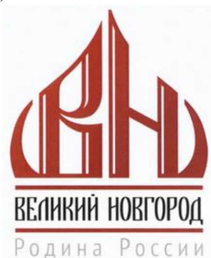
Figure 9. Brand of the city of Veliky Novgorod

3.3.2 A brand of the city of Veliky Novgorod (see fig. 9)