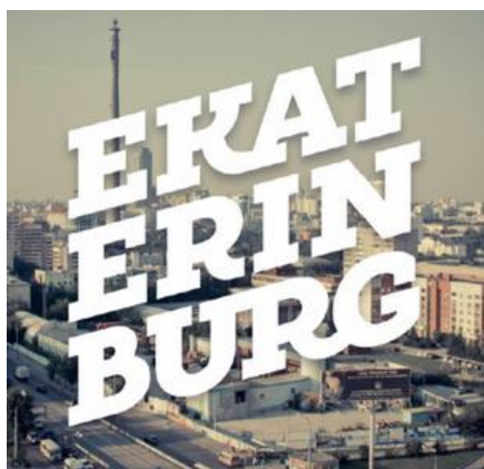
Figure 8. Brand of the city of Yekaterinburg

The logo of a brand of the city of Yekaterinburg was developed in 2015. The aspiration to show power, force, sure and stable development of the city, being the large industrial center, the capital of the Ural region was its basis.