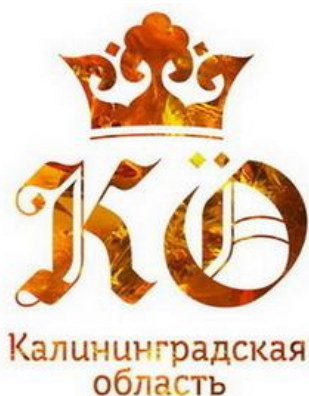
Figure 6. brand of the Kaliningrad region.

The crown represented on a brand forces to remember the old name of the city - Konigsberg, translated from German as "The royal mountain". Color in which the sootvetvuyushchy image is made reminds of amber which was and remains the business card and the main richness of this region.