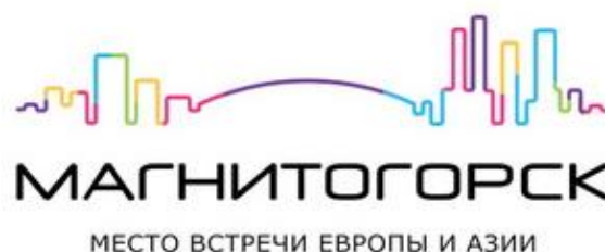
Figure11. City Brand Magnitogorsk.

3.4.1. Brand of the city of Magnitogorsk (fig. 11)