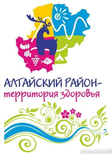
Figure16. Brand of the Altai region of Altai Krai

The main idea of this brand consists in its slogan: Uryupinsk is the capital of the Russian province. This slogan was born from long-term sneers and jokes that bigger "hole", than it is impossible to find Uryupinsk in Russia. At the same time the motive of pride and patriotism aimed at overcoming an inferiority complex at locals, consisting in the approval of the capital status of Uryupinsk, let and provincial origin clearly sounds. Brand of the Altai region of Altai Krai (see fig. 15).