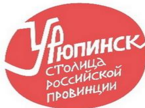
Figure15. Brand of the city of Uryupinsk

The main idea of this brand consists in its slogan: Uryupinsk is the capital of the Russian province. This slogan was born from long-term sneers and jokes that bigger "hole", than it is impossible to find Uryupinsk in Russia. At the same time the motive of pride and patriotism aimed at overcoming an inferiority complex at locals, consisting in the approval of the capital status of Uryupinsk, let and provincial origin clearly sounds. Brand of the Altai region of Altai Krai (see fig. 15).