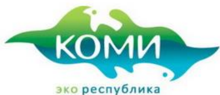
Figure4. Brand of the Komi Republic.

purposes for increase in recognition of the respective territory and increase in its competitiveness.