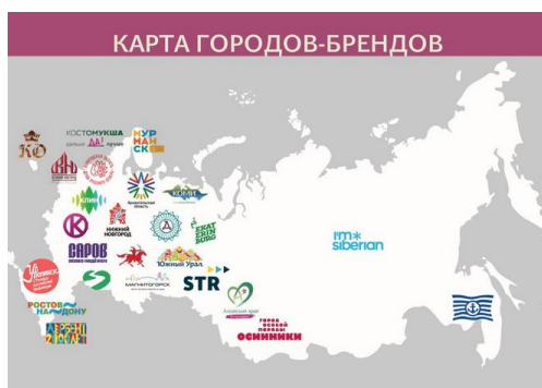
Figure1. Arrangement of territorial brands on the Russia map

On this card it is possible to see brands: