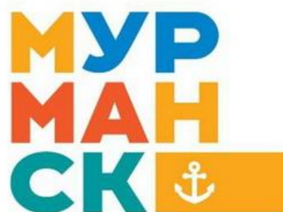
Figure12. Brand of the city of Murmansk

3.4.2 A brand of the city of Murmansk (see fig. 12).