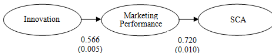
Figure 3. Path Diagram Based on Training Theory

empirical data. The model in the form of a path diagram based on the timing theory is shown in Figure 3.